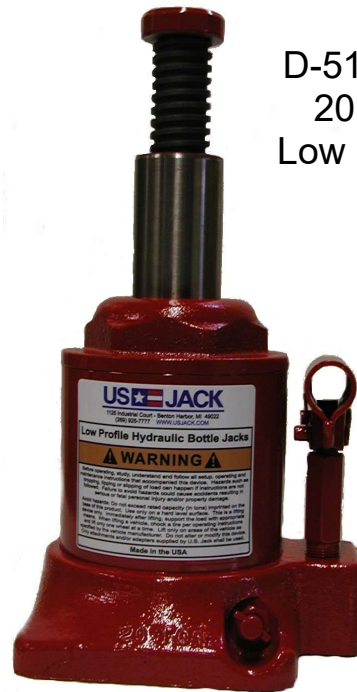
D-51126-5 20 Ton Low Profile