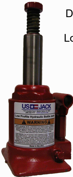
D-51125-5 12 Ton Low Profile

These heavy-duty American made low profile hydraulic hand/ bottle jacks are built for service under constant use. They feature a heavy-duty ductile-iron base for a wide stance and positive load support. All units feature a fluid bypass and a stop ring to prevent damaging over-travel. The intended use of all these models is for heavy-duty trucks, farm equipment, building construction, mobile home set-up, and as original equipment for manufacturers of many products. The 12-Ton model comes with a two-piece 21" zinc-plated handle and single piece release. The 20-Ton model comes with a three-piece 31" zinc-plated handle and a two-piece release.