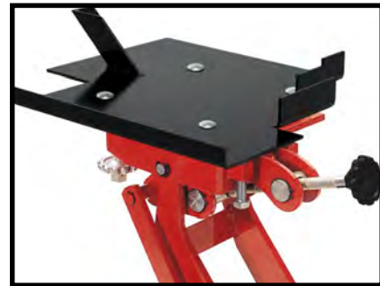
57203 - Fuller Eaton Roadranger Adapter Made in USA