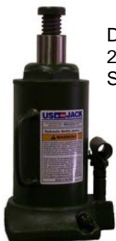
D-51126-2 20 Ton Low Temp Source control dwg# 12542740

In support of the M1A2 Abrams and M-60 MBT