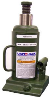
Model D-51014 12 Ton Hi-Range NSN 5120-01-573-5935 Source dwg.12505970 D-51014-2 Arctic dwg # 12505970-001