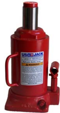
Model D-51126 20 Ton Standard NSN 5120-00-188-1788

In support of the M1A2 Abrams and M-60 MBT