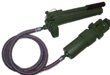
Pump End Puller Model no. 24-52701 NSN 5120-01-052-5642 Source control dwg# 11669394