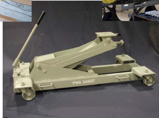
Model No. D-51403/PWA-24667 NSN 1730-00-005-5605 Use: Gear case handler

In support of the Hum-vees.....the F-MTV.....and the MRAP's