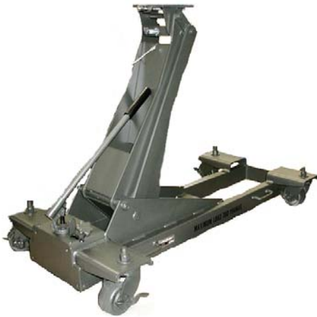
Model No. D-51403-2 NSN 1730-01-486-2539 Use: Ground support equipment for the F-22 Raptor