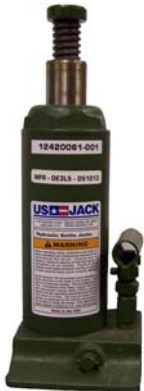
Model D-51013 8 Ton Hi- Range NSN 5120-01-374-0532 Source dwg. #12420061-001 Model D-51013-2 Arctic Kit version # 12420061-002 NSN 5120-01-480-0700

In support of the Hum-vees.....the F-MTV.....and the MRAP's