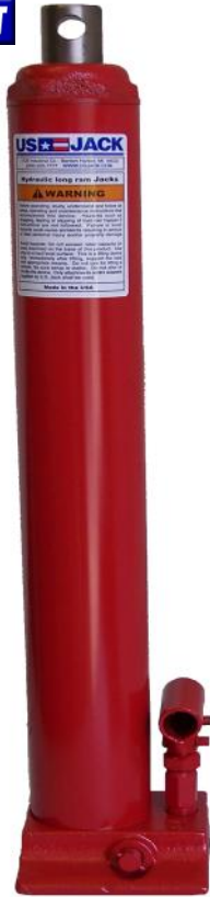
56100-C 5 TON