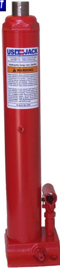
56091 5 TON