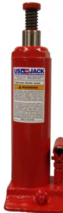
D-56160 8 Ton