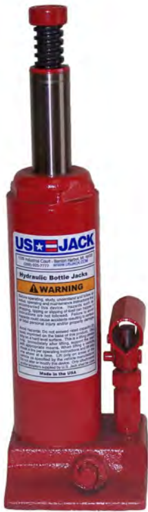
D-51011 3 Ton