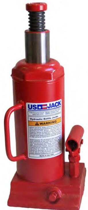
D-51014 12 Ton