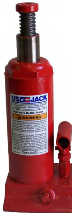
D-51013 8 Ton