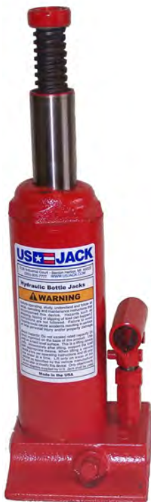
D-51012 5 Ton