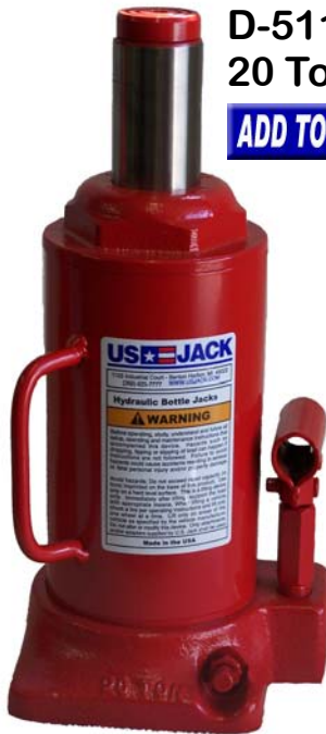
D-51126 20 Ton ADD TO CART