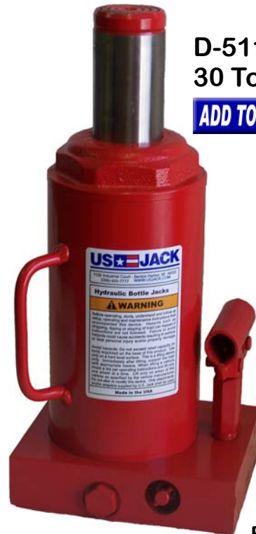
D-51127 30 Ton ADD TO CART