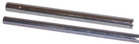
Two piece 21" zinc-plated handle provided

The intended use of all these models is for heavy-duty trucks, farm equipment, building construction, mobile home set-up, and as original equipment for manufacturers of many products.