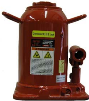
D-51160 60 TON * IMPORT

** Call for pricing and shipping charges