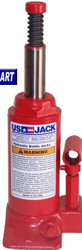
D-51123 5 Ton