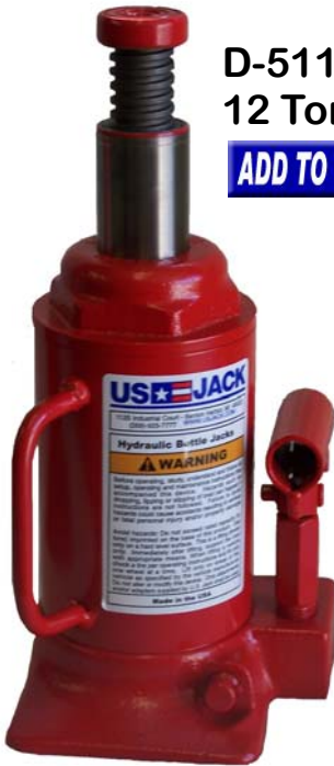
D-51125 12 Ton ADD TO CART