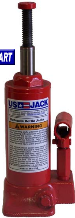
D-51122 3 Ton