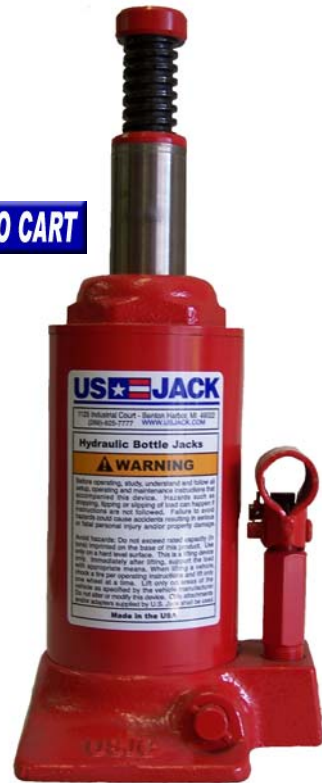
D-51124 8 Ton